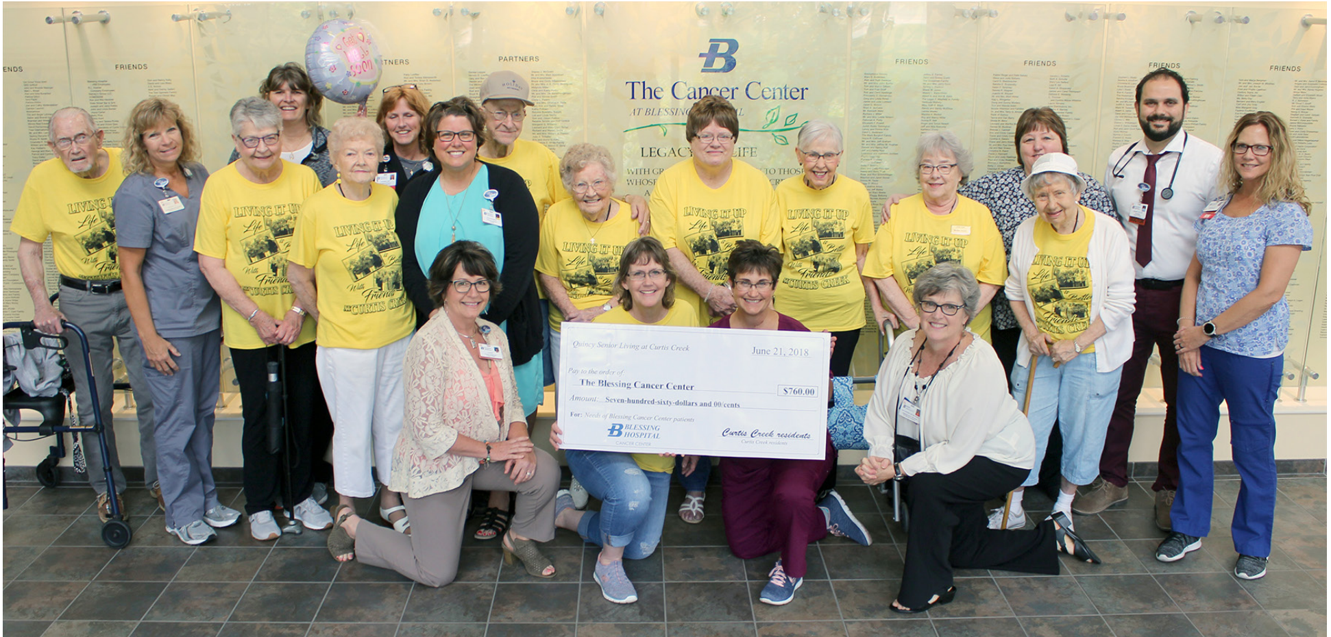
Residents of Curtis Creek Retirement Community present a check for their collected donations to the Cancer Center.