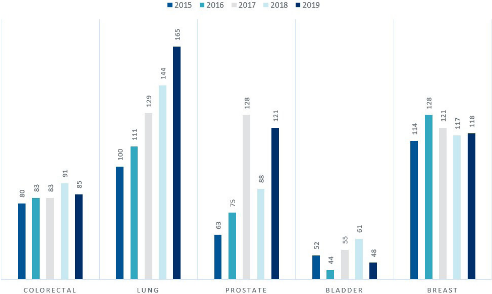
TOP 5 CANCER SITES DIAGNOSED AND/OR TREATED AT BLESSING HOSPITAL