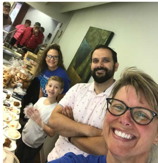
Blessing Cancer Center staff volunteer to prep and serve meals at Horizons.