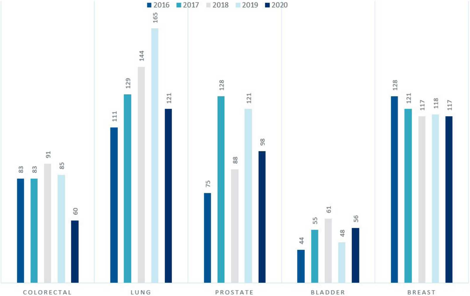
TOP 5 CANCER SITES DIAGNOSED AND/OR TREATED AT BLESSING HOSPITAL